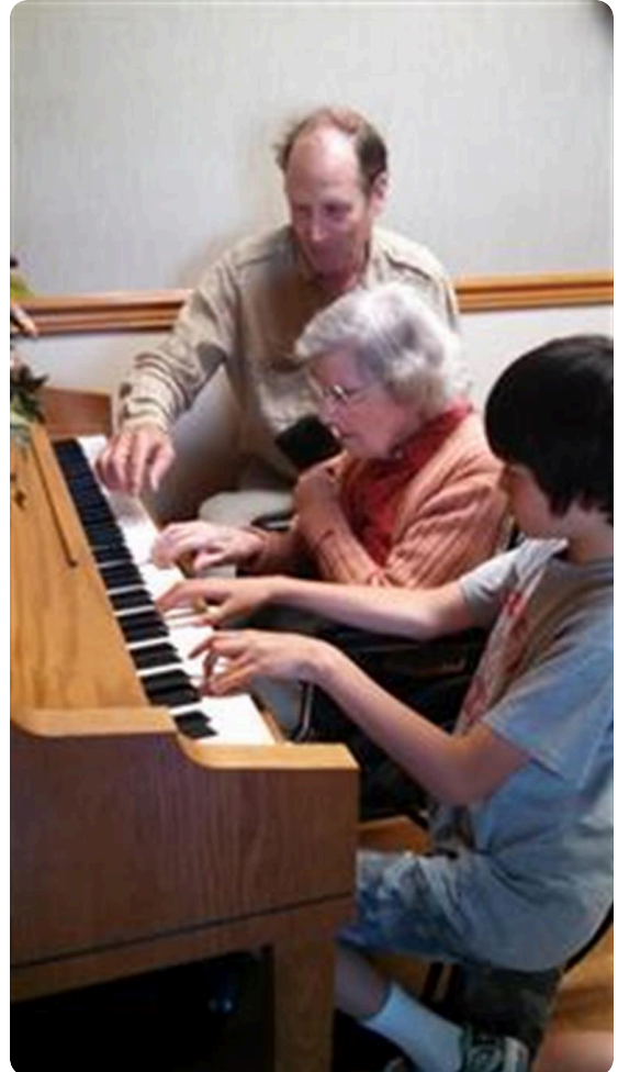
Still Playing Piano